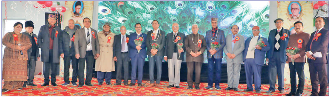
Sood Parivar Milan Divas Hoshiarpur held on 8th January 2023