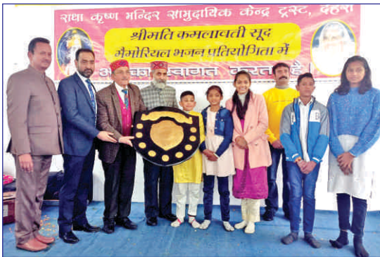
Late Smt. Kamlawati Sood Memorial Bhajan Competition at Dehra on 28.01.2023