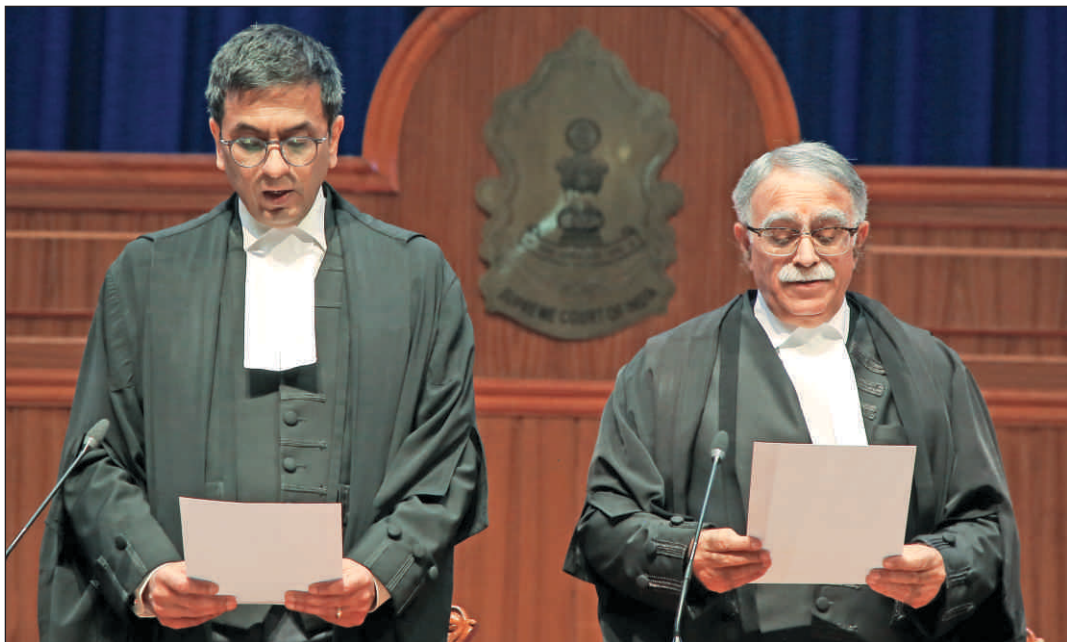
Hon'ble Chief Justice of India Sh. D. Y. Chandrachud, administrating the oath of office to Hon'ble Justice Sh. Sanjay Karol