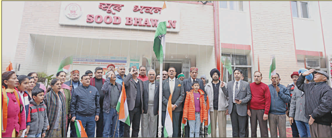
Flag hoisting on Republic Day at Sood Bhawan Chandigarh