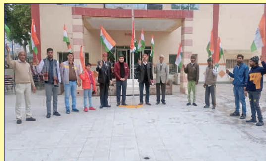
Flag hoisting at Panchkula Bhawan