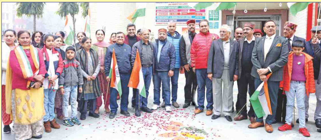
Republic Day Celebration at Chandigarh Bhawan with residents of nearby houses