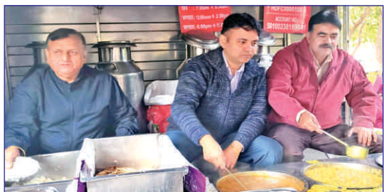
Social Activities - langar arranged by Sood Sabha